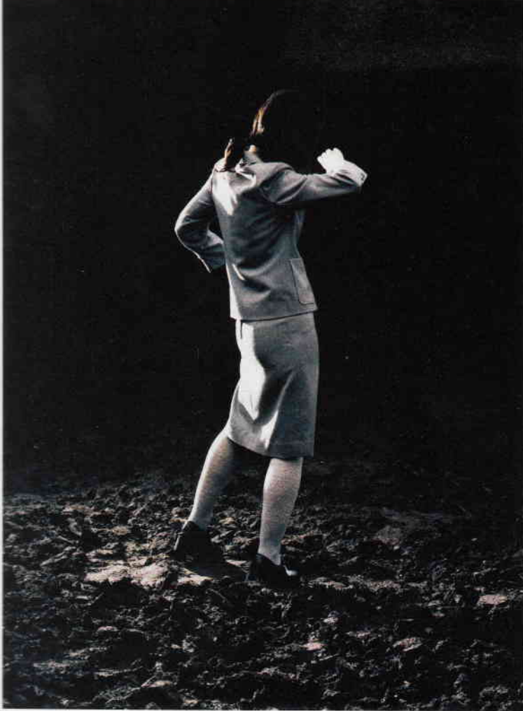
Untitled Movement No. 1, #6 (2006–08), type-C photograph, 60 x 50cm