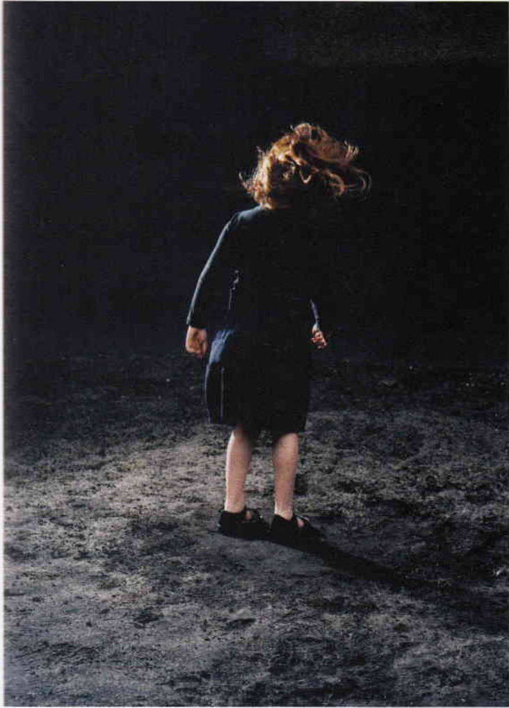
Untitled Movement No. 1, #10 (2006–08), type-C photograph, 60 x 50cm