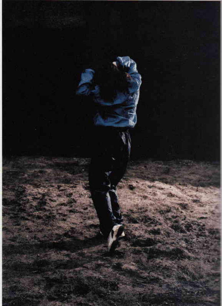
Untitled Movement No. 1, #9 (2006–08), type-C photograph, 60 x 50cm